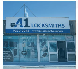
1/455 Scarborough Beach Road WA 6017