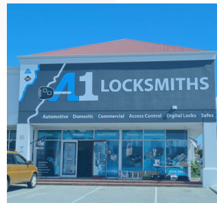
61A Pinjarra Road Mandurah WA 6210