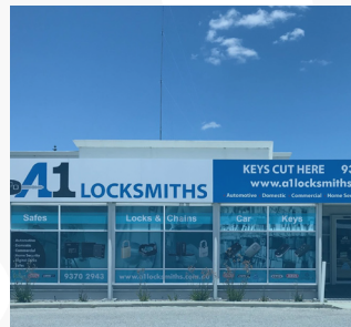
4 Marchant Way Morley WA 6062